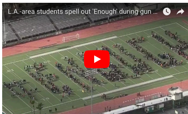
Students spell out “Enough”

We, the people, the children, are rising up saying, “Enough.”